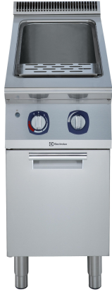
Modular Cooking Range Line Pasta Cooker, gas, 10.5gal

391201 (E9PCGD1MF2) Pasta Cooker, gas, Single 10.5 gallon (40 Lt) tank, 66lb/hour capacity each, automatic starch removal, automatic low water level control, 9 position energy control, 316 stainless steel tank, stainless steel cabinet & legs, 47,726 BTU