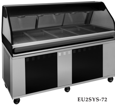
EU2SYS-72 FRONT VIEW SHOWN WITH OPTIONAL CASTERS