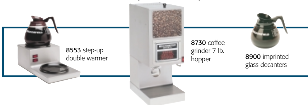
8553 step-up double warmer

ACCESSORIES: See the Bloomfield Brew Brew product catalog for a complete listing of brewers and accessories.