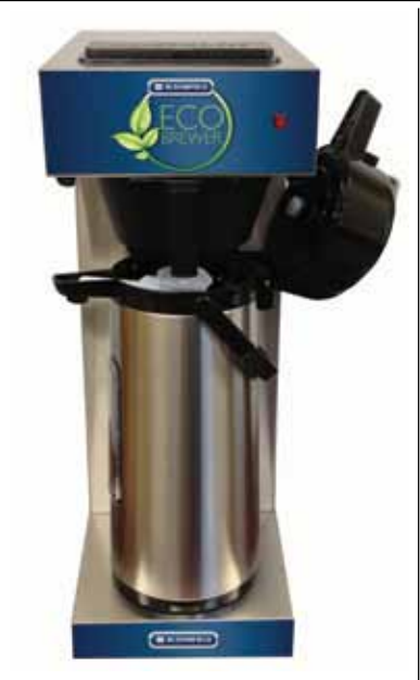
Model 4774-A (Airpot sold separately)