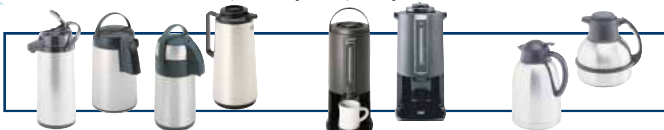
Complete line of Airpots for use with brewers with 13 3/8" clearance heights

ACCESSORIES: See the Bloomfield Brew Brew product catalog for a complete listing of brewers and accessories.