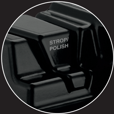
Stropping wheel for more efficiency