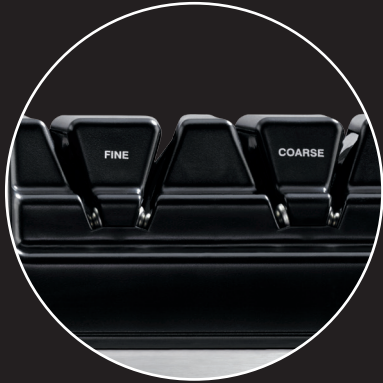
Fine and coarse grinding wheels