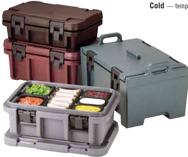
UPC160 Shown with dividers and fractional sized food pans.