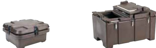
UPC100 No divider bars available for UPC100.