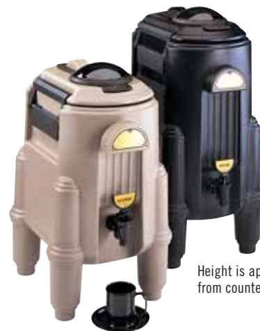
CSR5 Shown in Black.

Height is approximately 7" from counter to spigot.