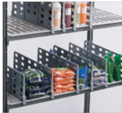
Keep sealed packages neatly stacked.