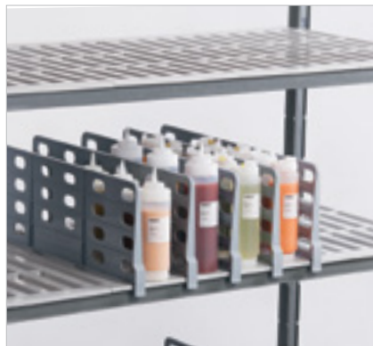
Keep squeeze bottles organized.