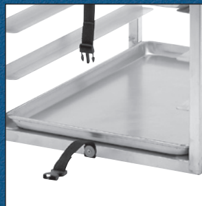
/015 Pan Stop Web-Strap