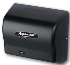
Steel Black Graphite