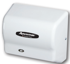
Steel White Epoxy