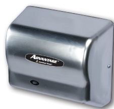
Steel Satin Chrome