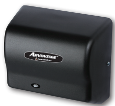
Steel Black Graphite