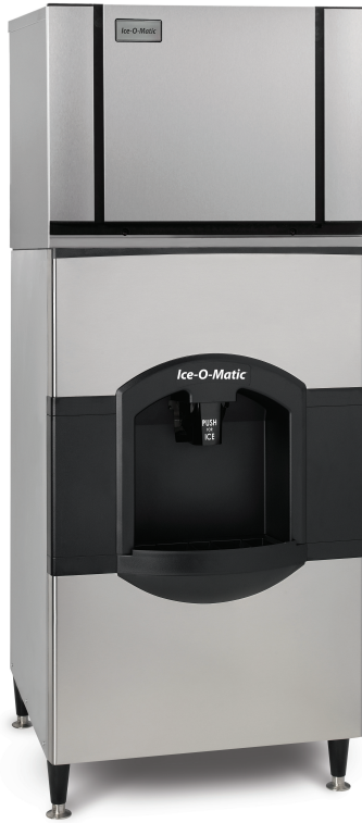
CD40030 with CIMO330