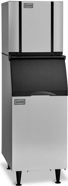
CIMO826 ON B42