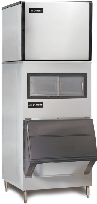
ICEO856 ON B700-30