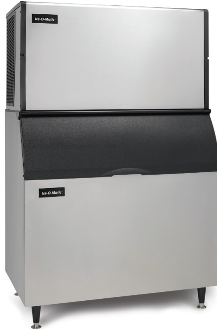
ICE1406 ON BIOO