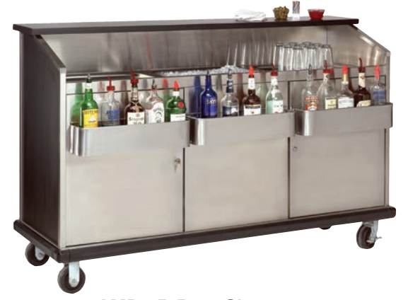
AMD-6B Rear Shown