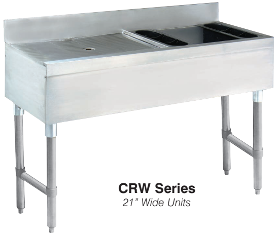
CRW Series 21" Wide Units