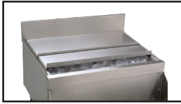
Optional Sliding Stainless Steel Cover Shown