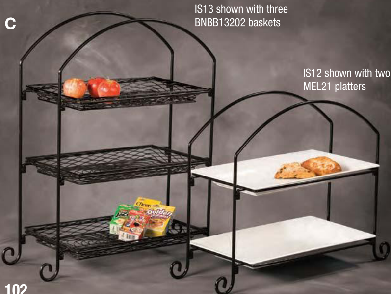
IS13 shown with three BNBB13202 baskets