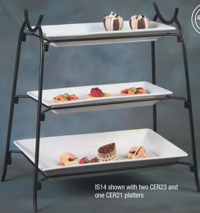
IS14 shown with two CER23 and one CER21 platters