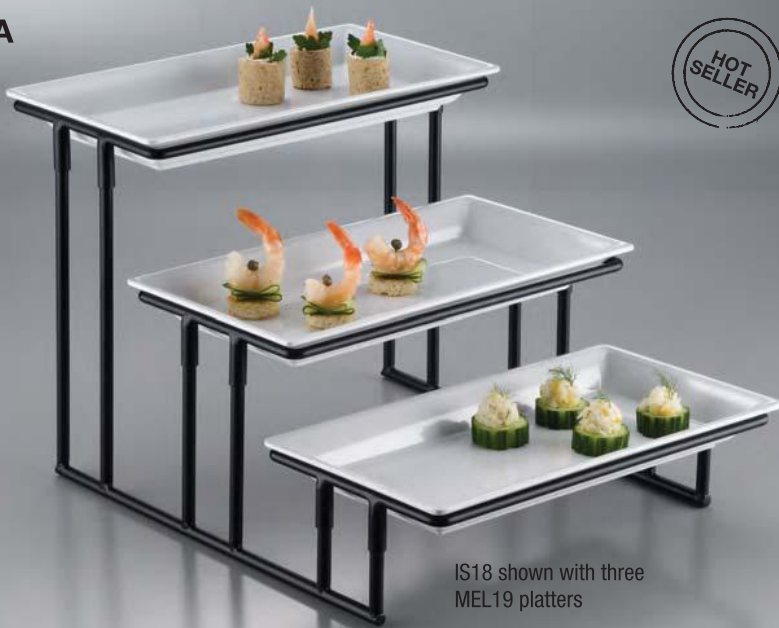
IS18 shown with three MEL19 platters