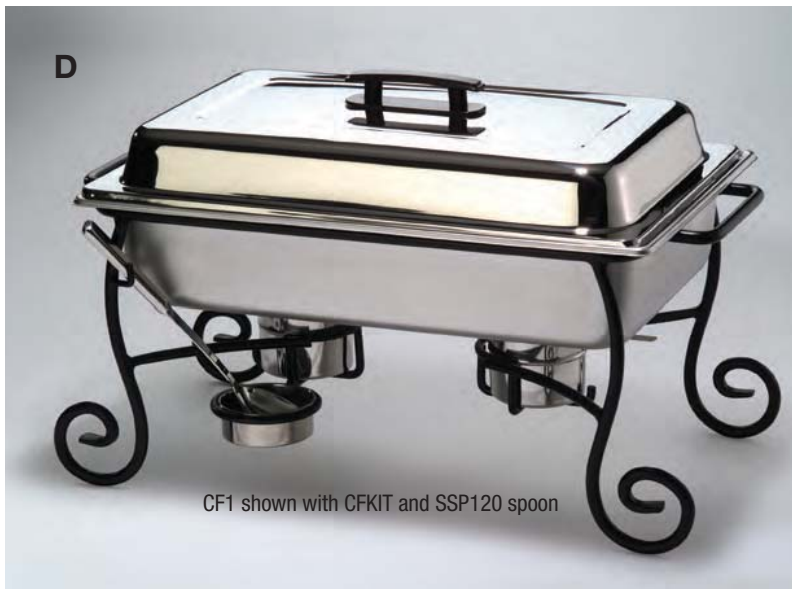
CF1 shown with CFKIT and SSP120 spoon