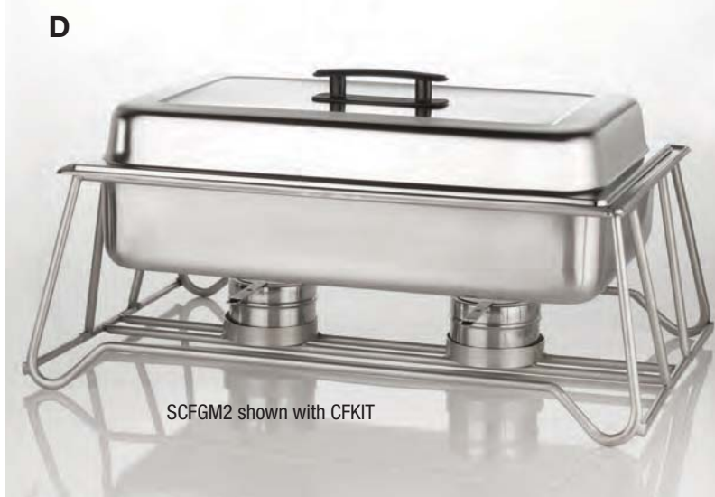
SCFGM2 shown with CFKIT