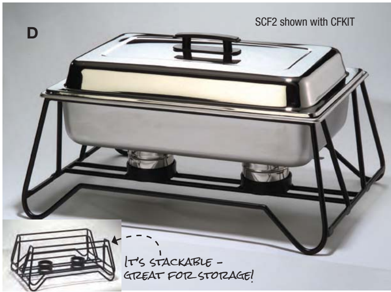
SCF2 shown with CFKIT