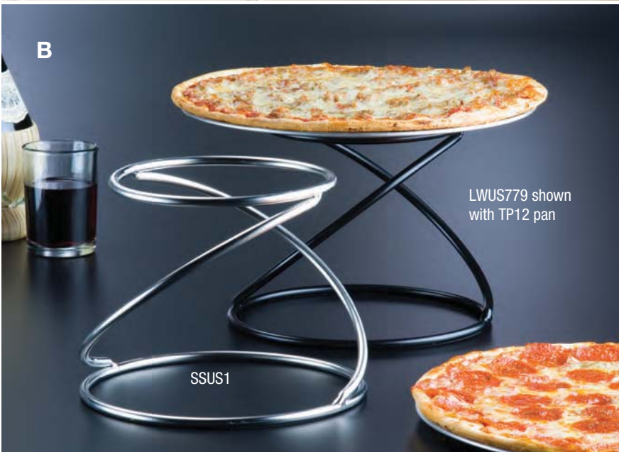
LWUS779 shown with TP12 pan