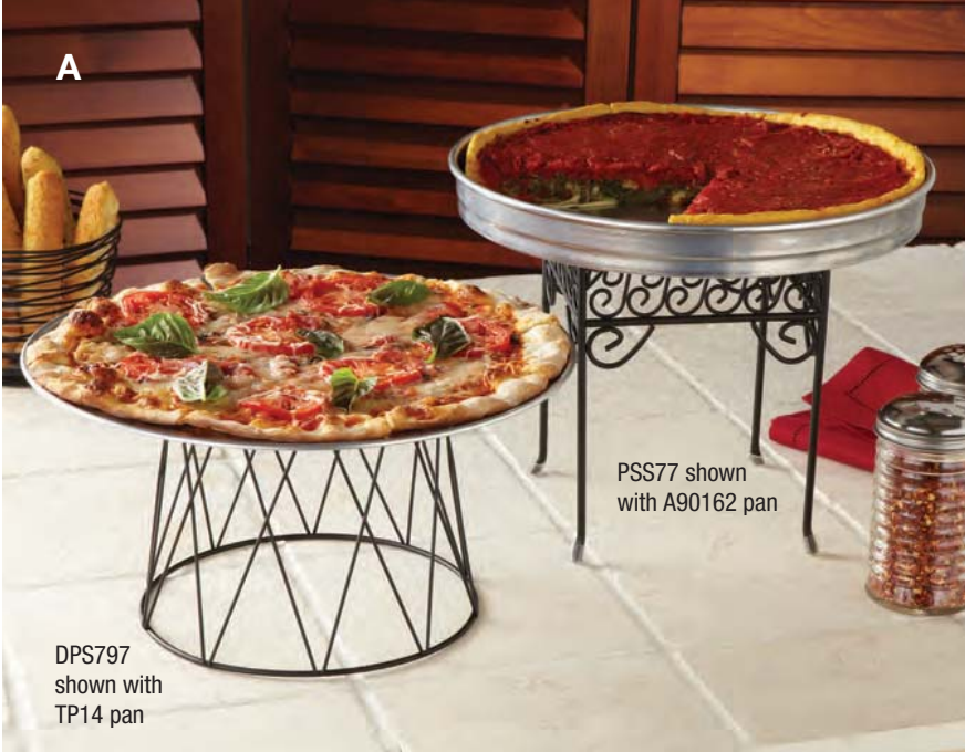
PSS77 shown with A90162 pan