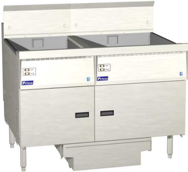
Unit shown is FBG18/FD/FBG24