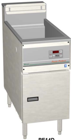
PE14D Pasta Cooker

Model PE14D, RSE14D, PPE14D-L (LL) Electric Pasta Cooker and Rinse