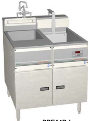
PPE14D-L Rinse Station / Pasta Cooker