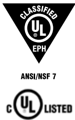
Item Number: DXDBC110