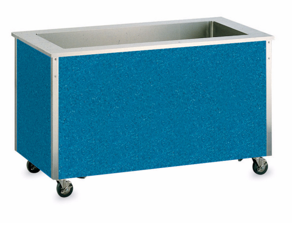
Signature Server<sup>®</sup> Classic Cold Food Stations