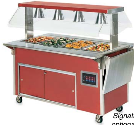
Signature Server® 4-Well Hot Food Station with optional Access® Buffet Breath Guard with lights

Signature Server® Counter Accessories And Options