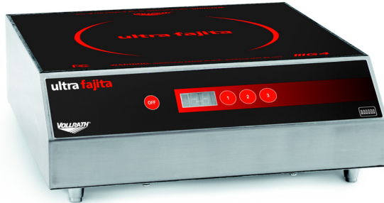
Ultra Induction Fajita Skillet Heater