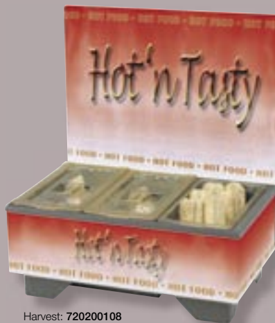
Harvest: 720200108 Base with Menu Board — order pans and covers separately