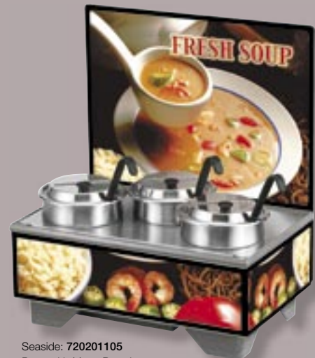
Seaside: 720201105 Base with Menu Board and 4 qt. Accessory Pack