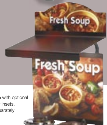
Item 3702803 Shown with optional black laminate –order insets, covers and ladles separately