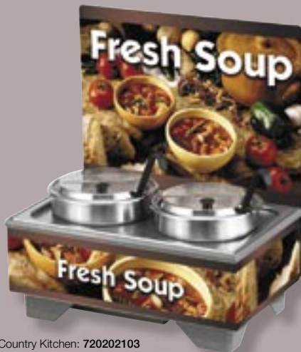
Country Kitchen: 72020103 Base with Menu Board and 7 qt. Accessory Pack