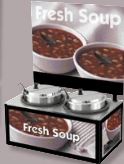
White Bowl: 7203104 (Order insets, covers and ladles separately)