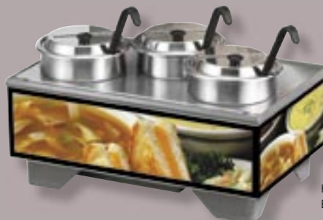
Homestyle: 720201006 Base with 4 qt. Accessory Pack

For ordering information, see pages 6-17 and 6-18