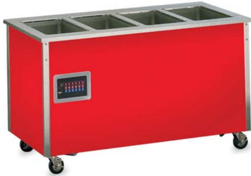
Signature Server® with Stainless Steel Counter 4 Well Hot Food Base