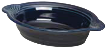
oval baker 13 oz 587105 2" deep 5-5/8" wide 9-1/4" long

Mix and match colors and shapes to make the extraordinary possible. Fiesta®'s famously rich palette always coordinates.