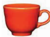
cup 7-3/4 oz 452338 fits: 470 saucer