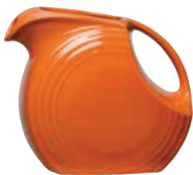
disc pitchers 4-3/4 oz 475325 67-1/4 oz 484325