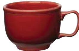
jumbo cup 18 oz 149326