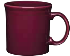
java mug 12 oz 570341