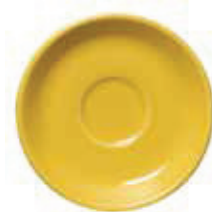
saucer 5-7/8" 470320 fits: 452 cup