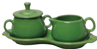
sugar/cream tray set 821324