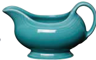
sauceboat 18-1/2 oz 486107