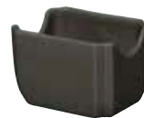
sugar packet 3-1/2" x 2-3/4" 479339