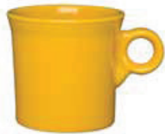
mug 10-1/4 oz 453342