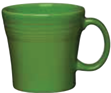
tapered mug 15 oz 1475324