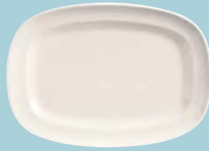
10 1/2" x 7 1/2" Racetrack Plate No. BW-1123 H1 1/8 1 doz./21# • .5 cu. ft.