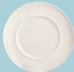
8" Coupe Plate No. BW-5208 H1 1/8 3 doz./32# • 1.0 cu. ft.