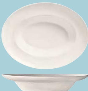
11 1/2" x 9" - 18 oz. Oval Bowl No. BW-1118 1 doz./26# • .9 cu. ft.