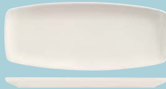
14" x 6" Long Tray No. BW-1449 H7/8 1 doz./26# • .6 cu. ft.