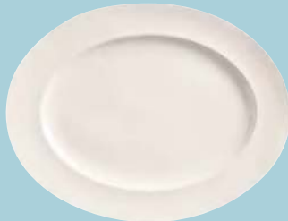
11 1/2" x 8 3/4" Platter, MR No. BW-1120 H1 1/8 1 doz./26# • .7 cu. ft.