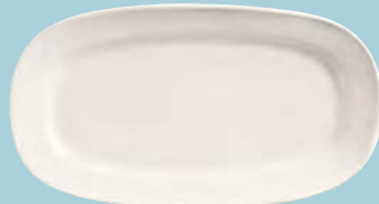
10" x 5 1/2" Racetrack Platter No. BW-1125 H1 1 doz./16# • .3 cu. ft.