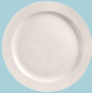
6 1/4" Plate, MR No. BW-1113 H5/8 3 doz./29# • .7 cu. ft.