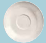
4 1/2" Espresso Saucer No. BW-1160 WL1 1/8 3 doz./13# • .4 cu. ft.