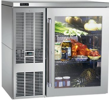
BBS36 with optional glass/wine stainless steel door shown