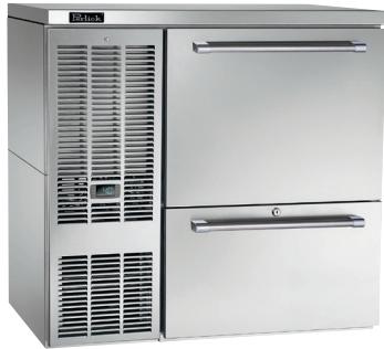
BBS36 with optional wine drawers shown