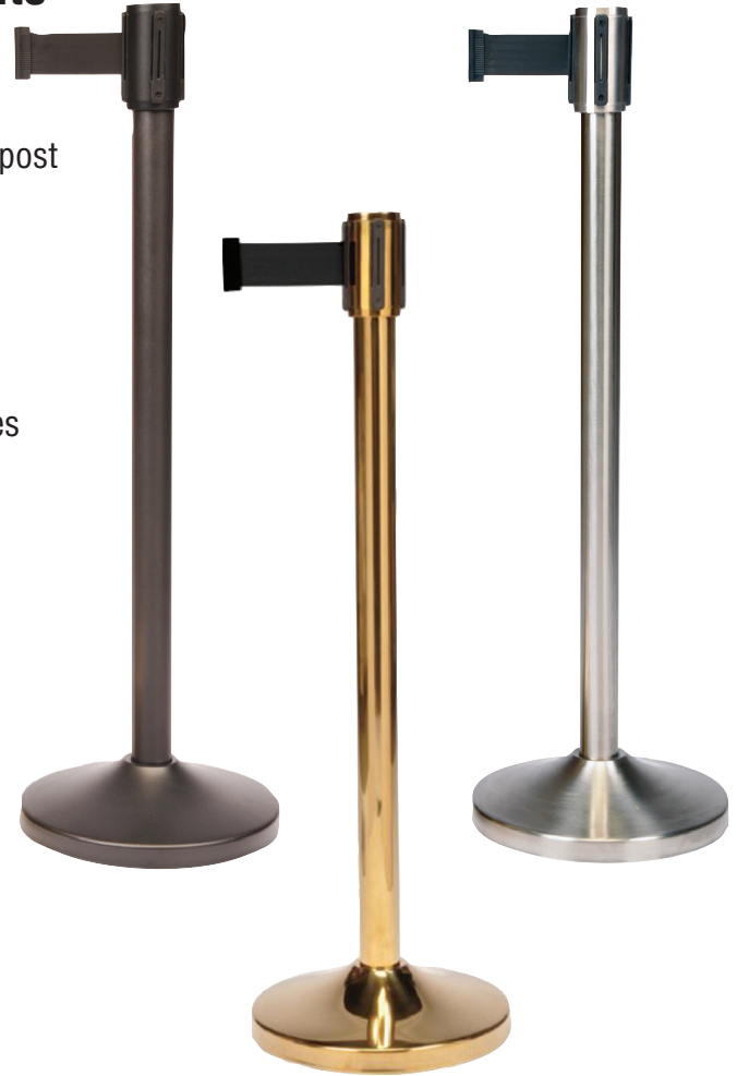
Stanchion: Height: 39" Base: 12.5" diameter Weight: 24 lbs.