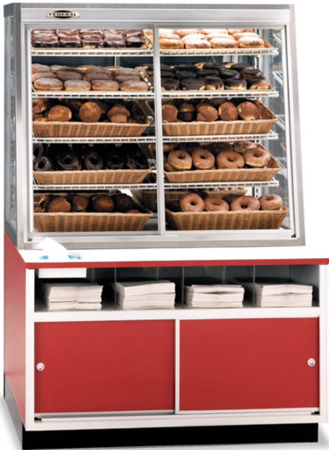
Model WDC-42 Shown

Generate increased impulse sales with maximum product exposure.