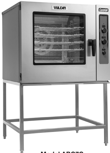
Model ABC7G (shown on stand)