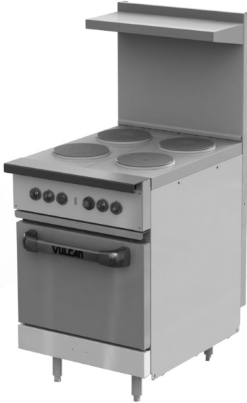
Model EV24S-4FP208 shown with adjustable legs