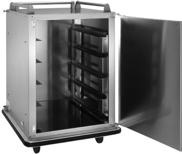
Model RS-10 shown with optional full perimeter bumper