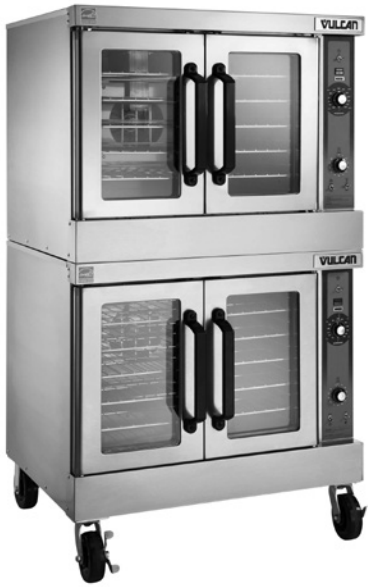
Model VC44GD shown with optional casters