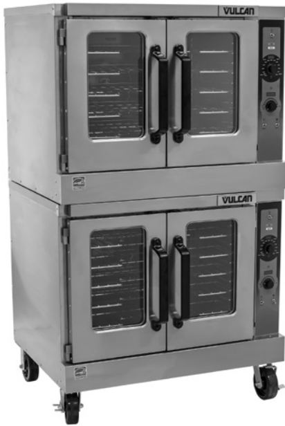
Model VC55GD Shown with optional casters