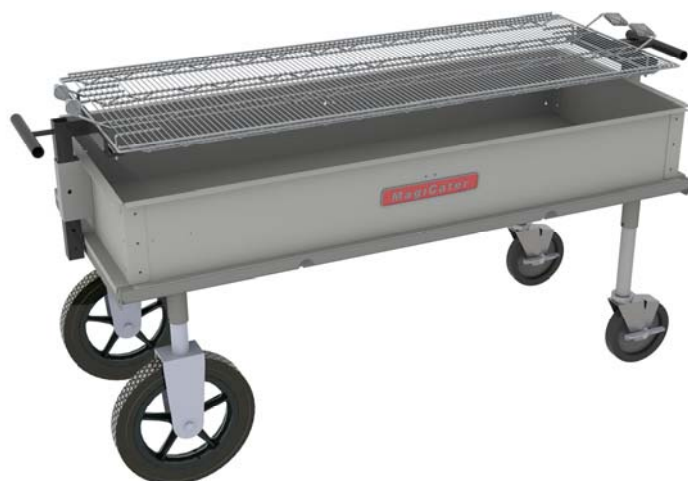
Shown with Optional EZ Roll Wheel