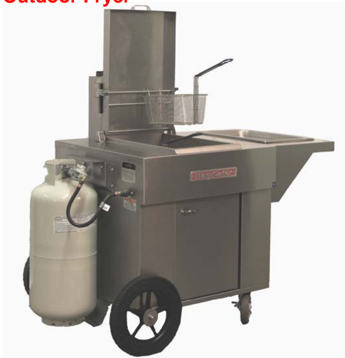
Shown with optional Dump Station