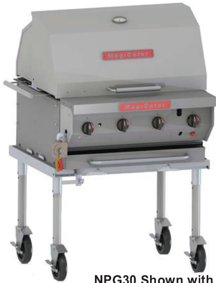
NPG30 Shown with options