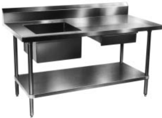
Custom Worktable w/sink, drawer & riser