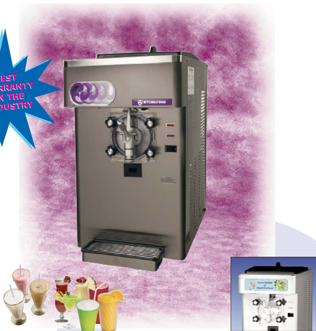
Optional light kit available.