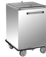
ICE STORAGE CART SIC-222

FWE Products are used by major companies world-wide. We can modify, design, or custom build equipment to fit your special requirements.