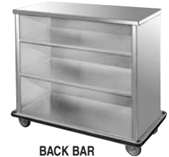
BACK BAR SPSC-44

Holds 200 lbs. of ice! Fully insulated. Flip-top stainless lid. Drain, push bar handle, and all swivel 5" casters. Welded steel frame.