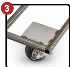
Tubular Welded Base Frame