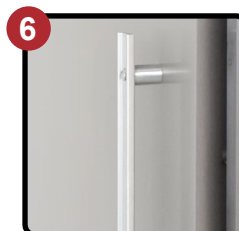
Push Pull Handles