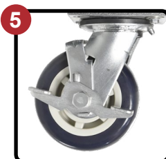
Built for Transport