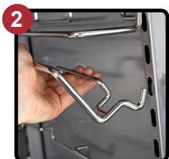
Adjustable Tray Slides