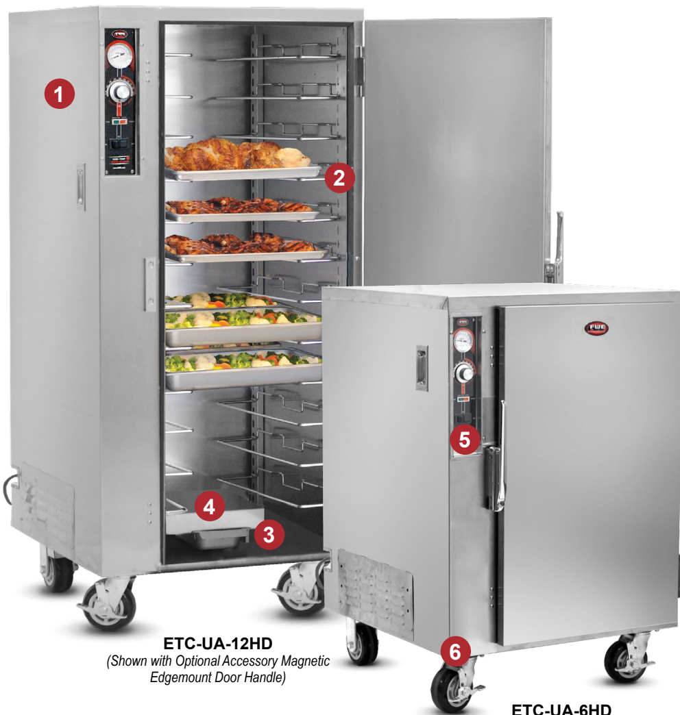
ETC-UA-12HD (Shown with Optional Accessory Magnetic Edgemount Door Handle)

Economy Universal Server keeps bulk foods hot, moist and oven fresh