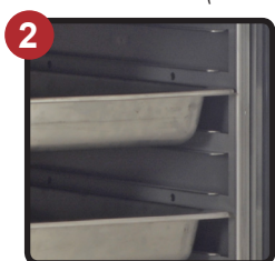
Unique Pan Slides