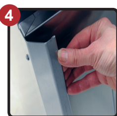
Work Flow Handles