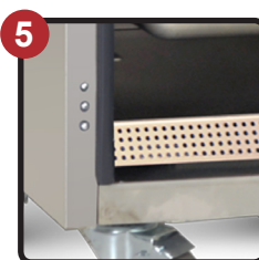
Field Reversible Door