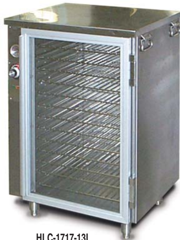
HLC-1717-13L Shown with See-thru Door