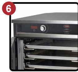
User Friendly Electronic Controls