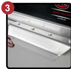
Magnetic Work Flow Door Handle