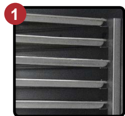
Versatile Fixed Rack

(Shown with Left Hand Door Hinging and Adjustable Tray Slide Optional Accessory)