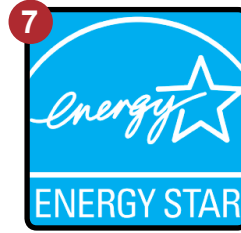
Energy Star Approved